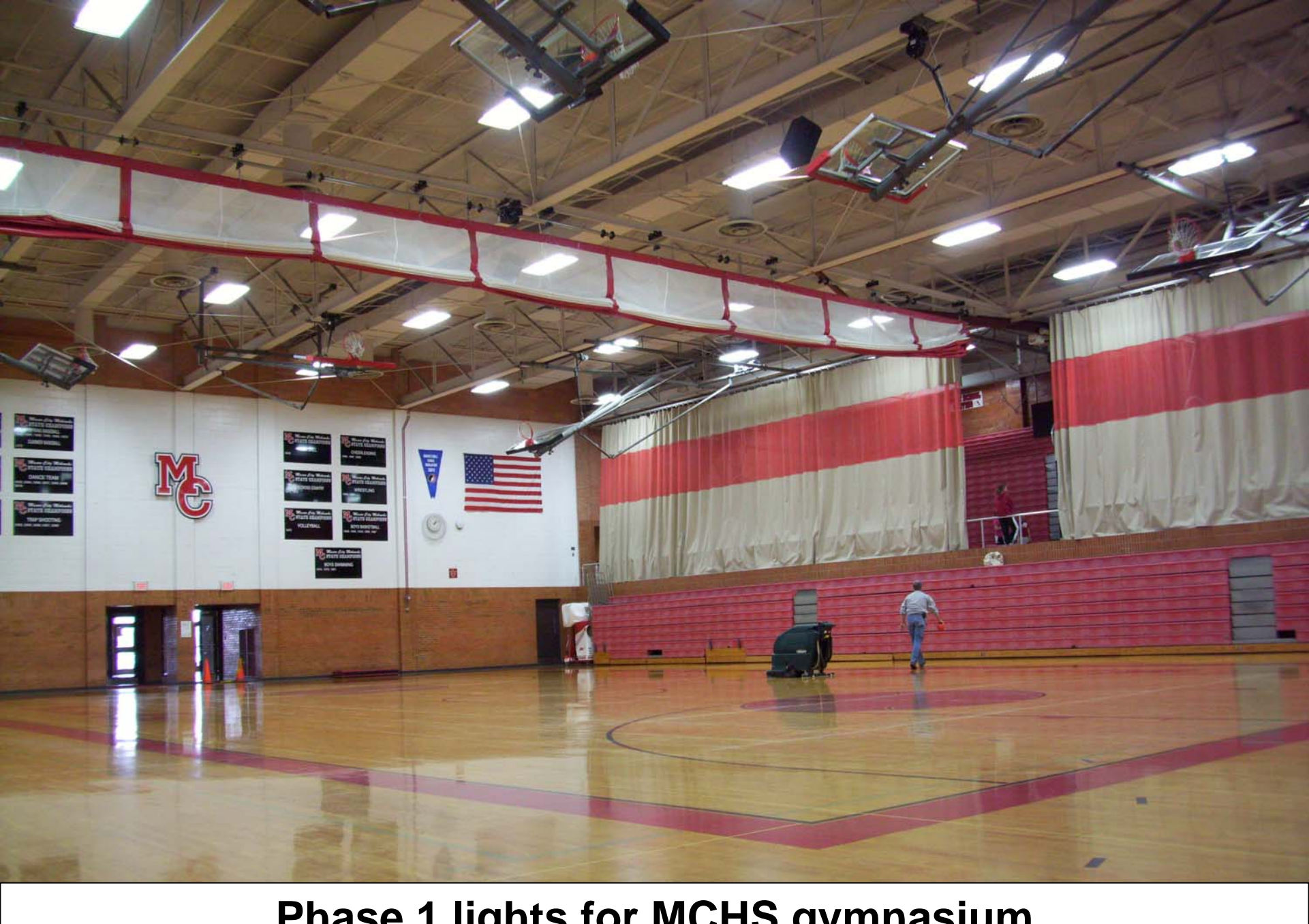
Phase 1 lights for MCHS gymnasium