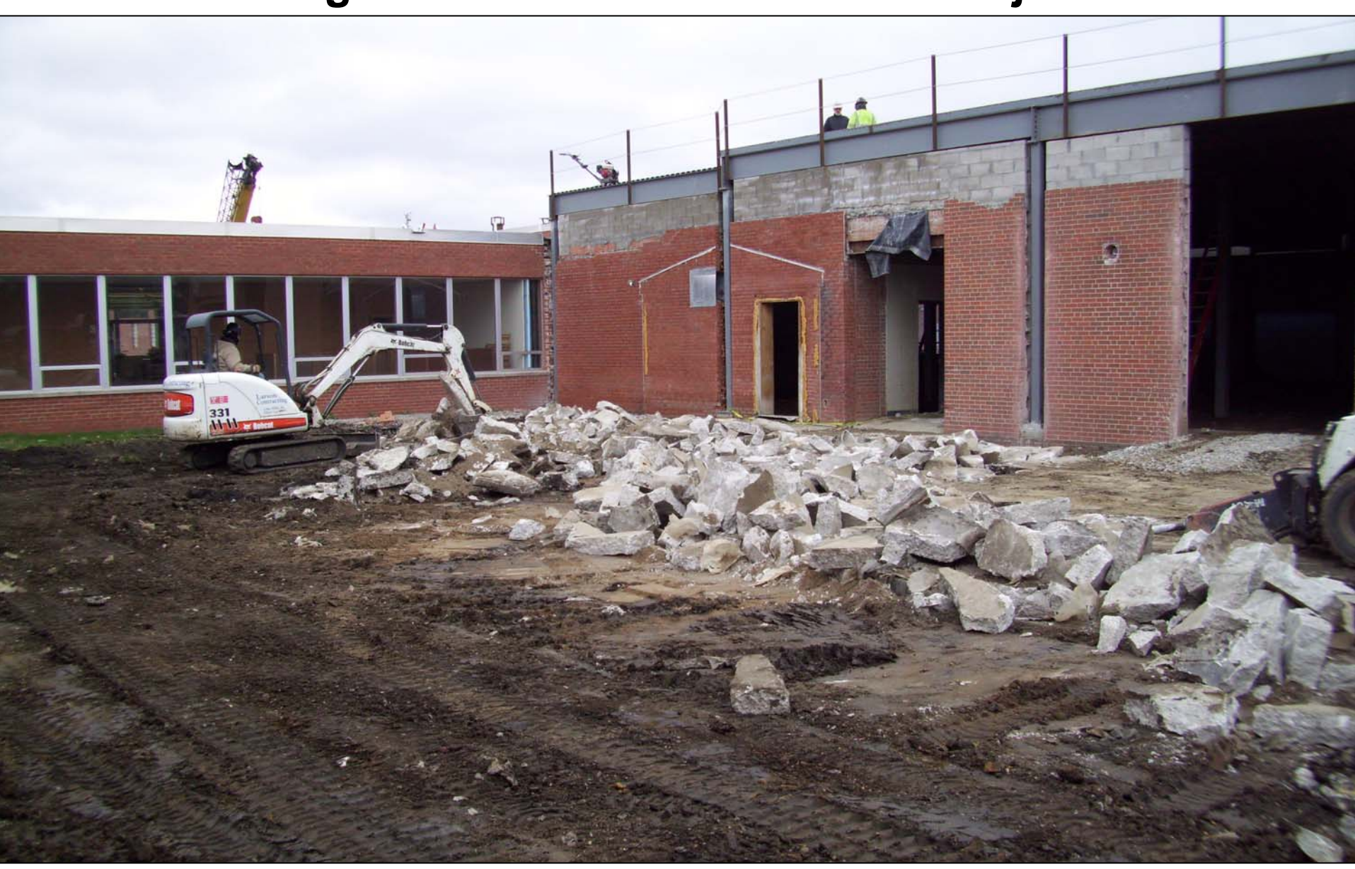
Area 'E' Food Service and Dining Addition