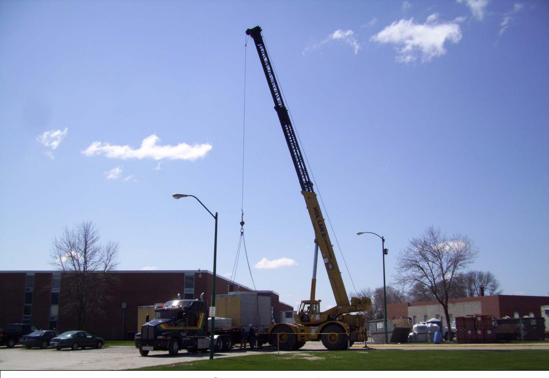
C towers arrive