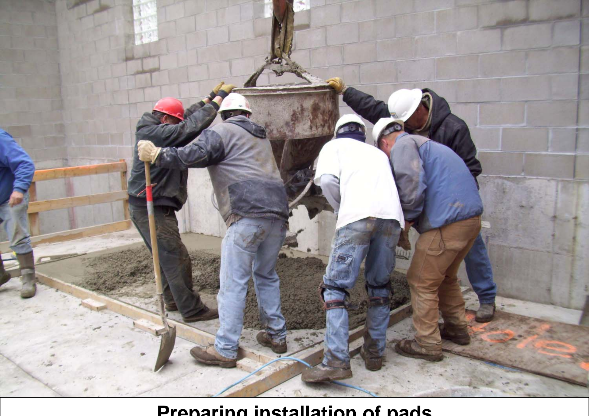
Preparing installation of pads