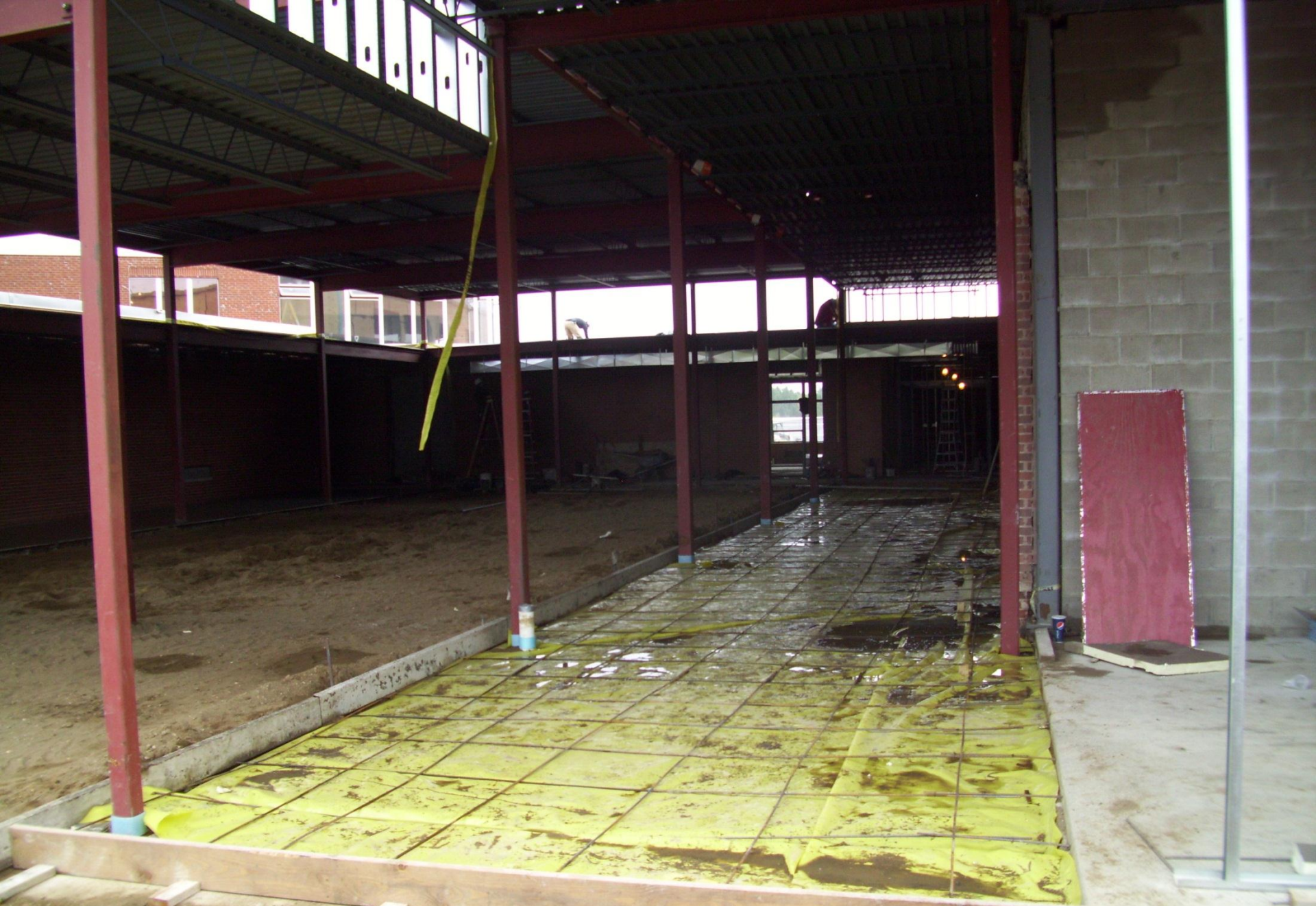
Phase 3A Cafeteria Floor