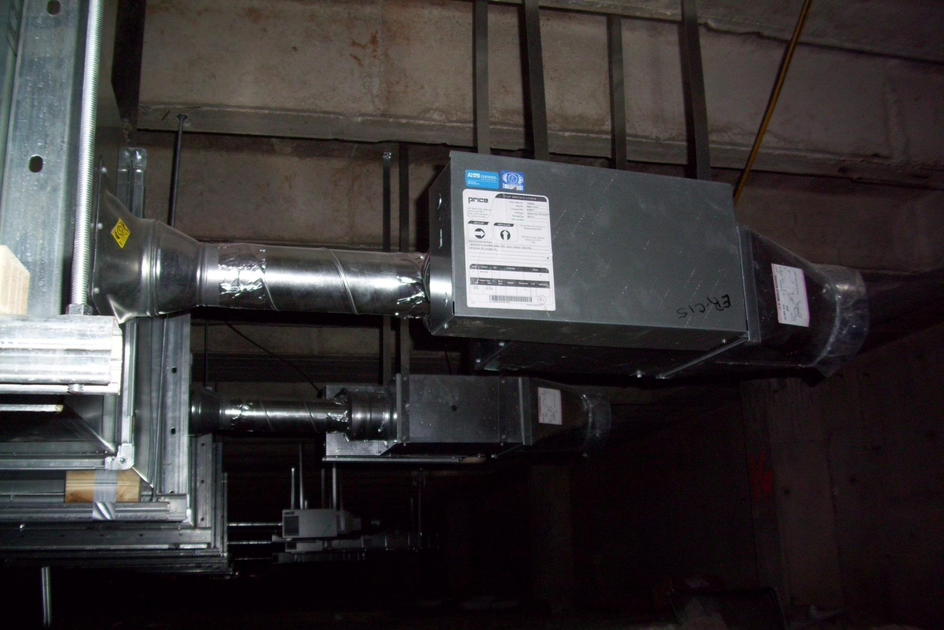
Phase 3B VAV Box