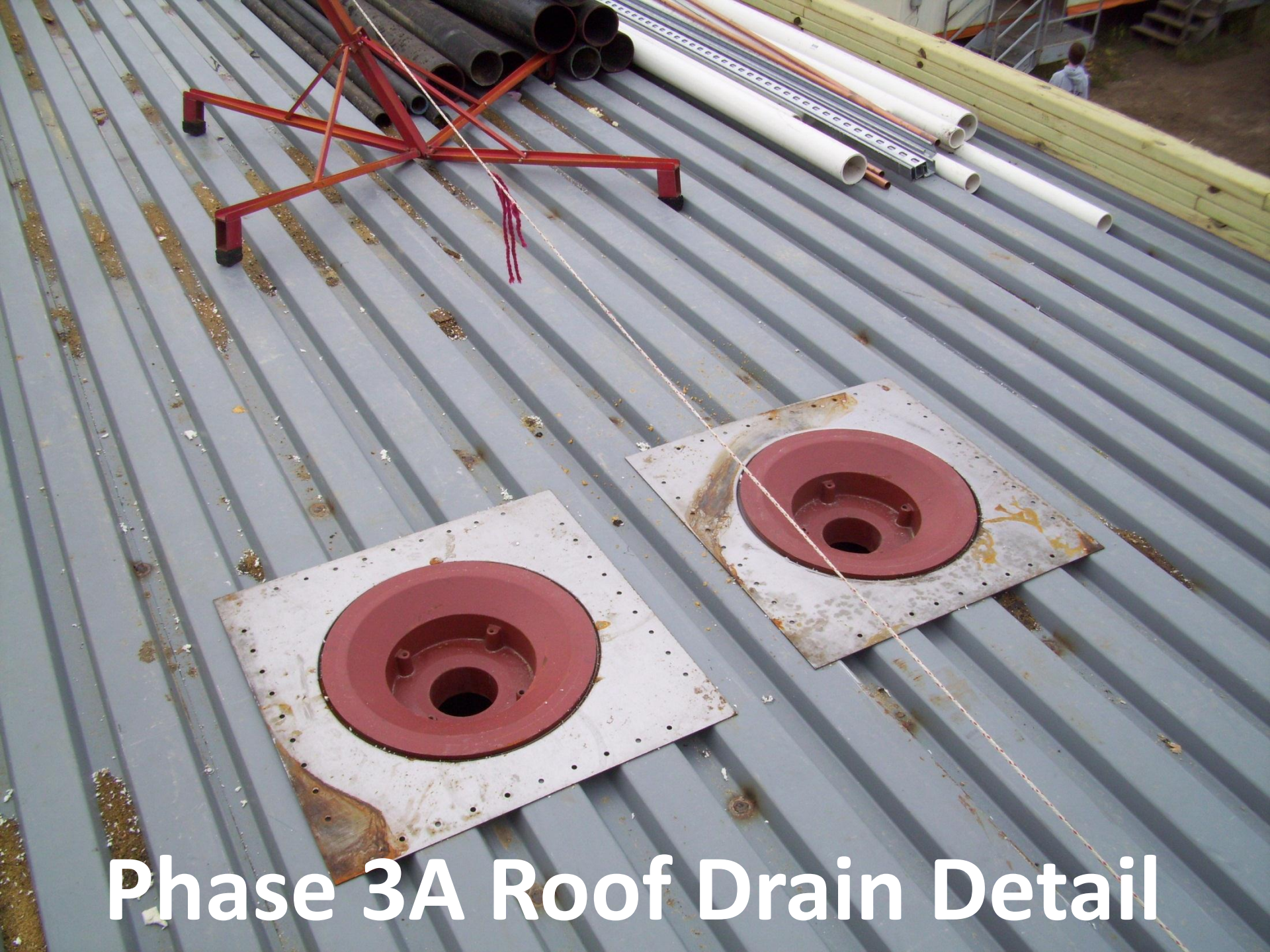
Phase 3A Roof Drain Detail