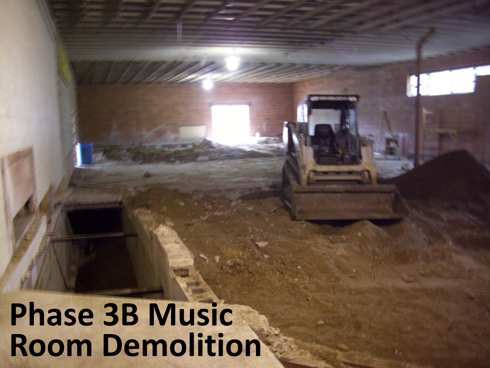
Phase 3B Music Room Demolition