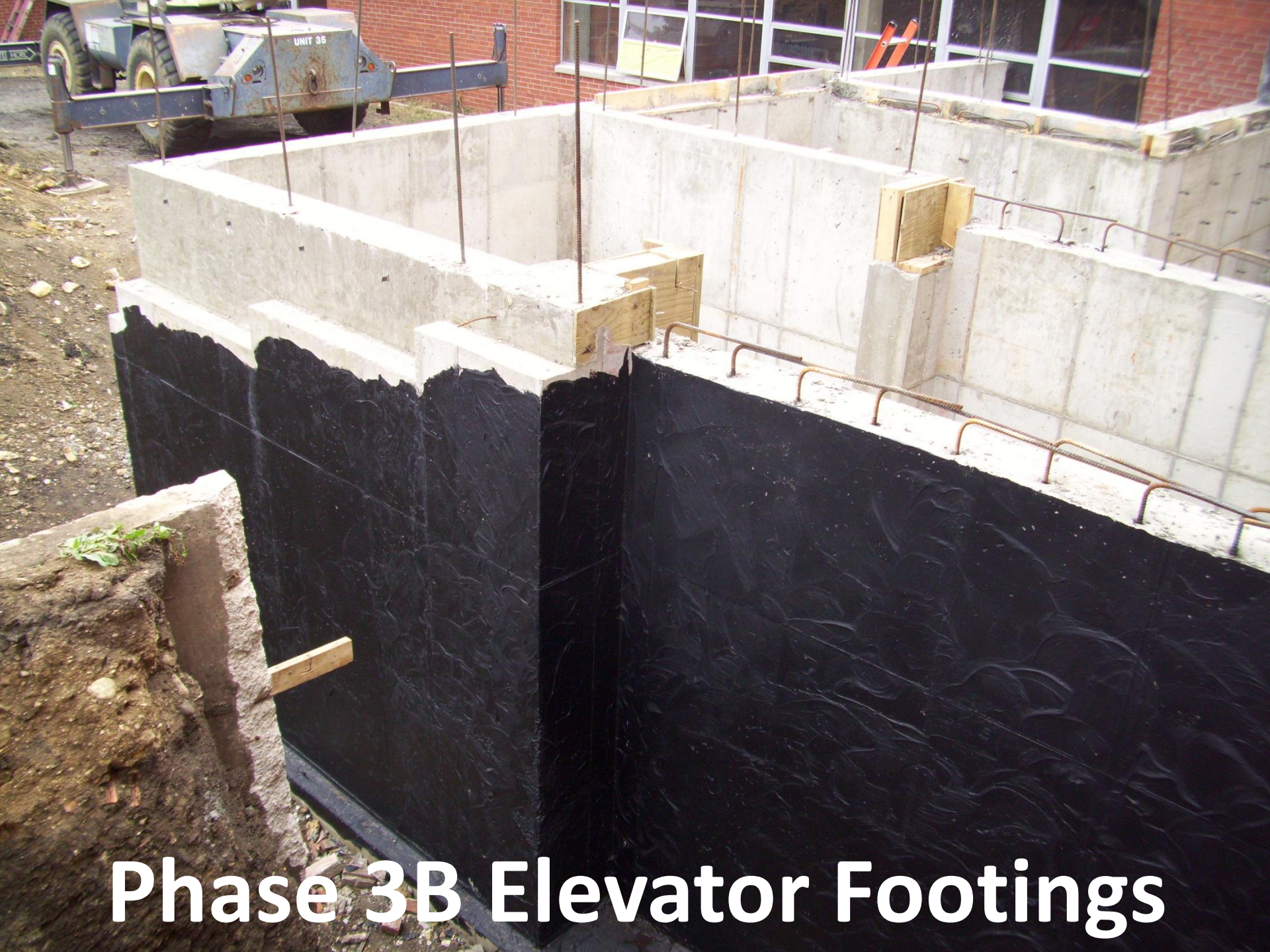
Phase 3B Elevator Footings