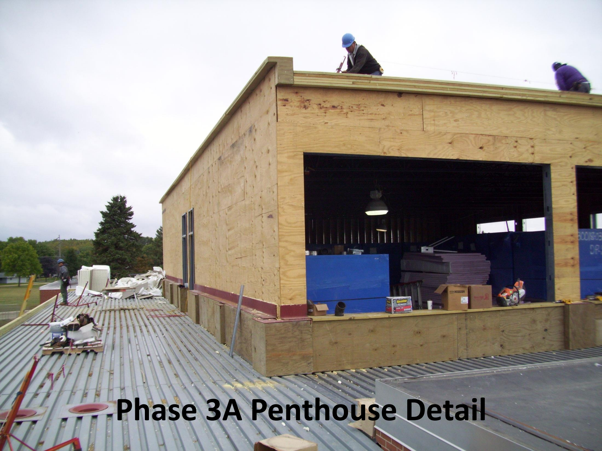
Phase 3A Penthouse Detail