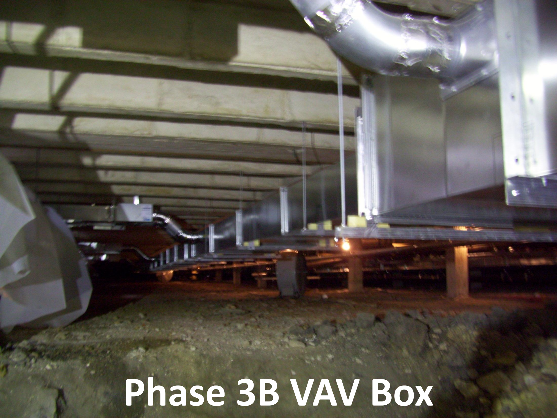
Phase 3B VAV Box