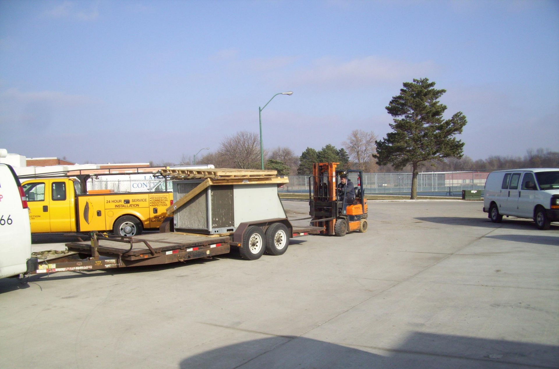
Freezer Rooftop Unit