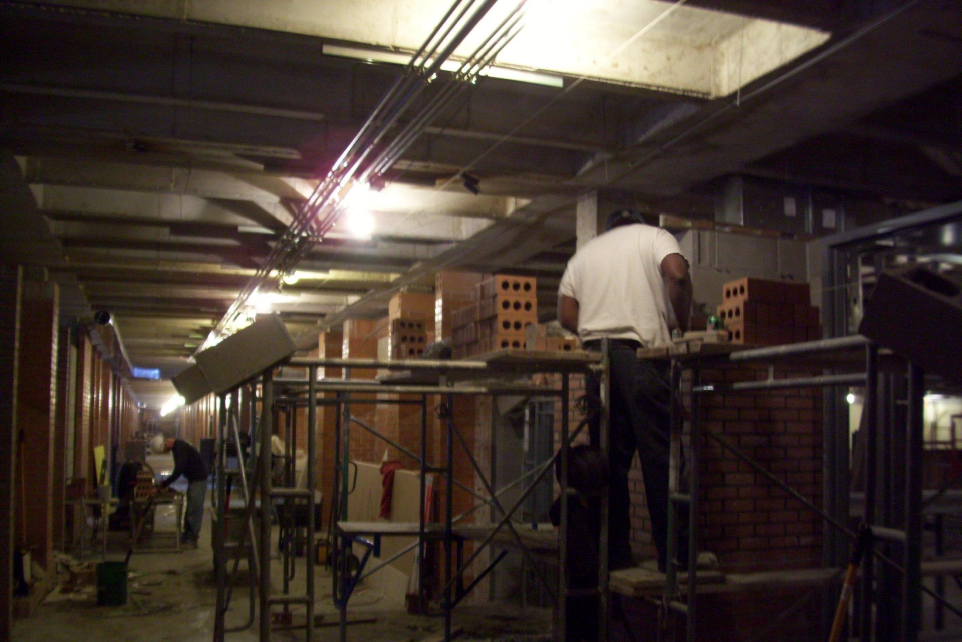
Phase 3B Hall Facing Brick