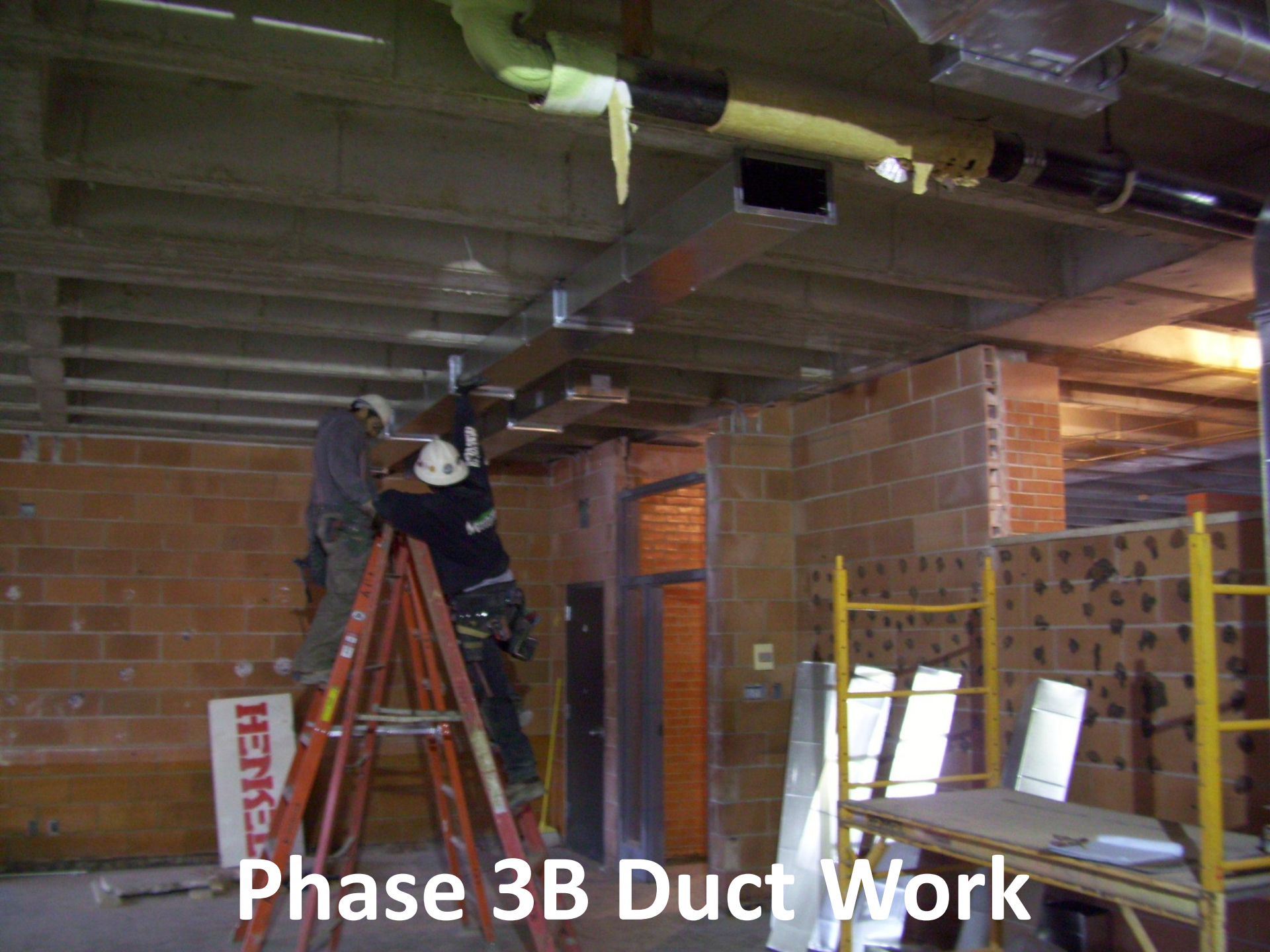
Phase 3B Duct Work