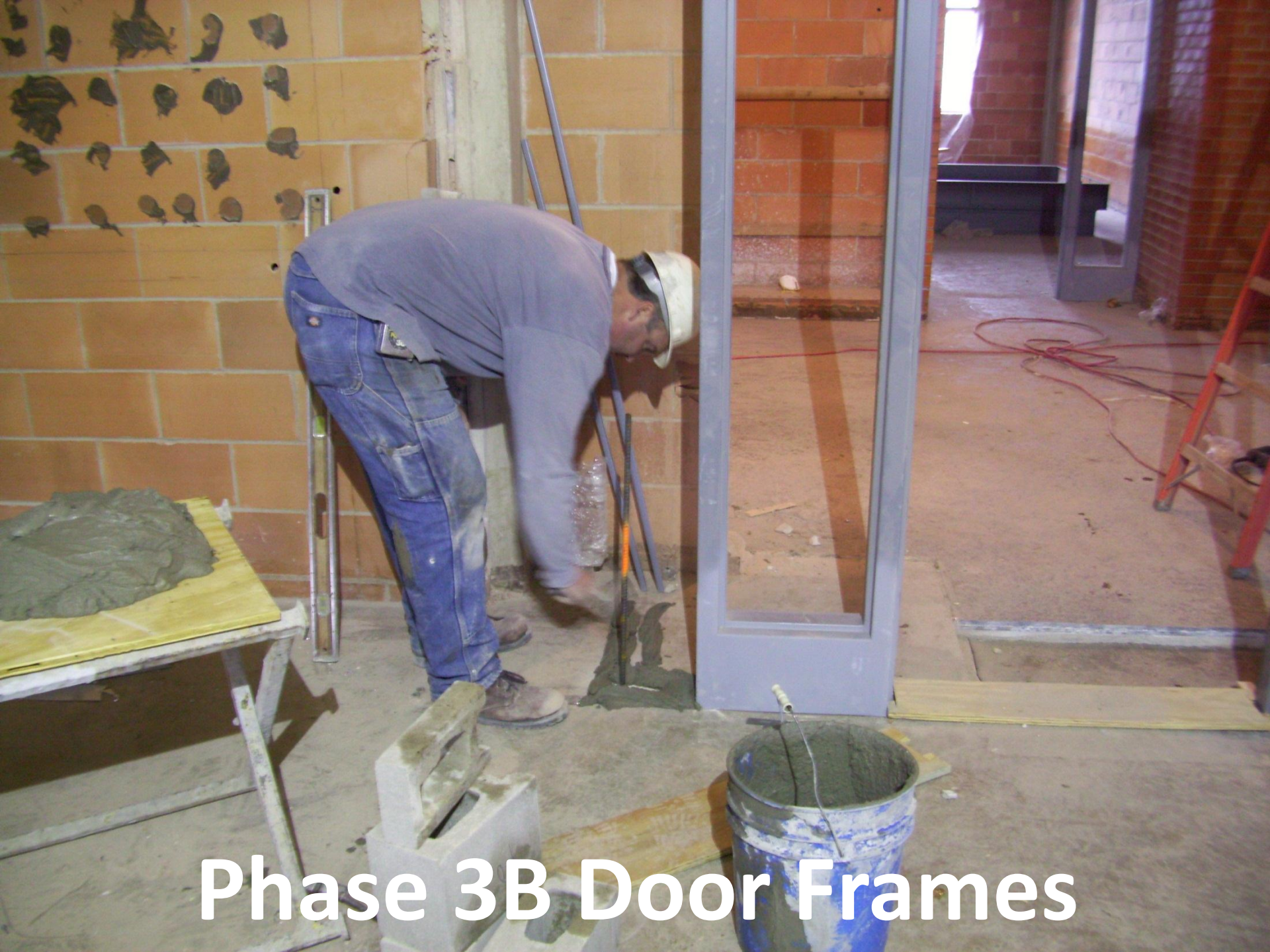
Phase 3B Door Frames